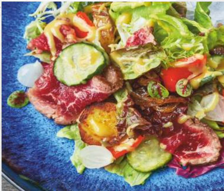
ROAST BEEF WITH GREENS MIX AND ROASTED SWEET PEPPER