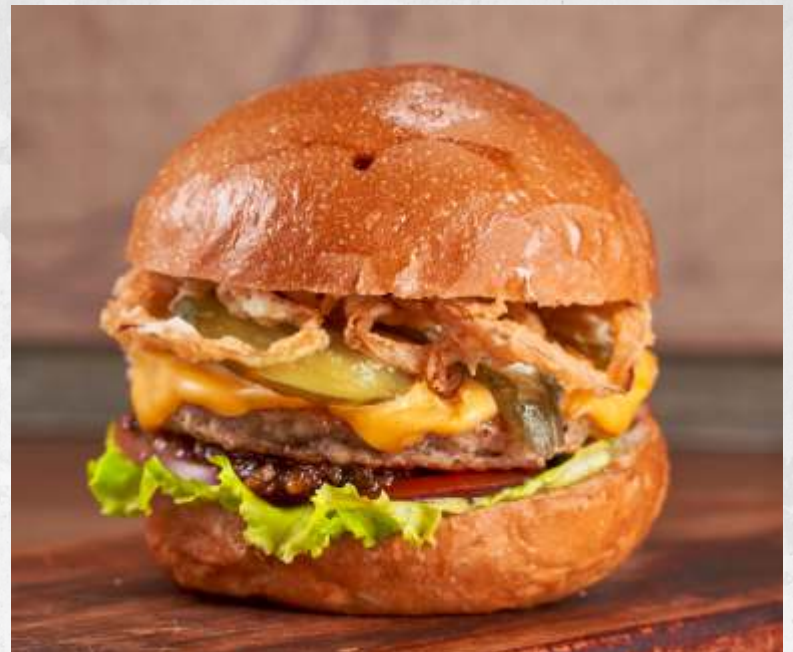
JALAPECO CHEDDAR TURKEY BURGER SERVED WITH JACK DANIELS SAUCE