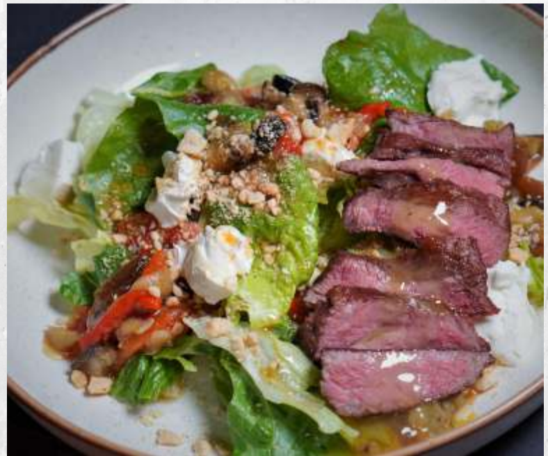
WARM BEEF SALAD WITH ROAST VEGETABLES