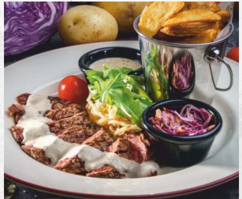
MARBLED BEEF STEAK WITH BABY POTATOES, PARMESAN MOUSSE AND CRANBERRY MARMALADE