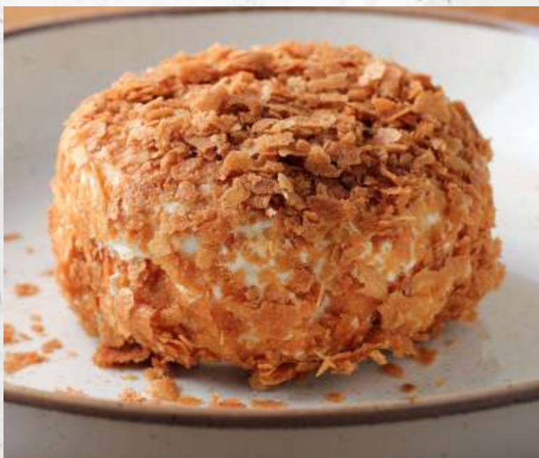
RUSSIAN SOUR CREAM CAKE WITH WAFFLE CRUMBS AND VANILLA SAUCE