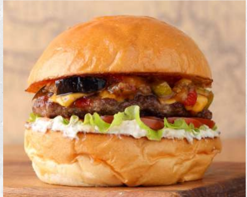
MARBLED BEEF BURGER WITH SAUTEED VEGETABLES AND FETA CHEESE SAUCE