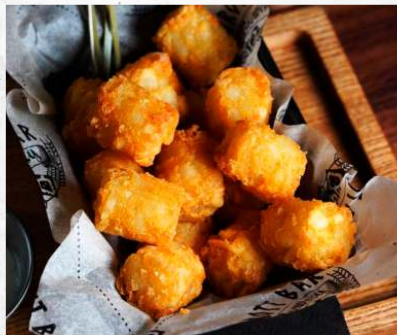
FRIED MOZZARELLA BALLS SERVED WITH CREAMY SAUCE AND HONEY