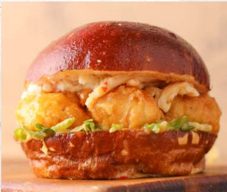
BALI STYLE SHRIMP TEMPURA BURGER