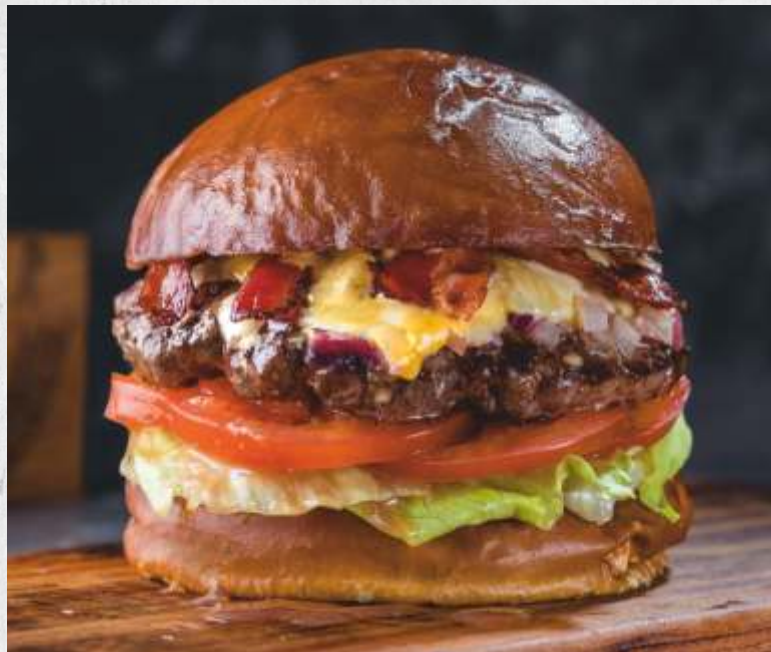
GROTT BURGER WITH DORBLU CHEESE SERVED ON BRIOSH BUN OR BREZEL LOAF WITH COLESLAW