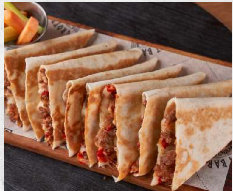
MARBLED BEEF AND JALAPECO QUESADILLAS