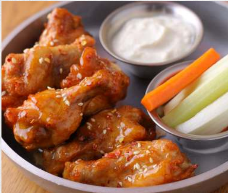
CHICKEN WINGS WITH SPICY SAUCE SERVED WITH CELERY, CARROTS AND BLUE CHEESE SAUCE