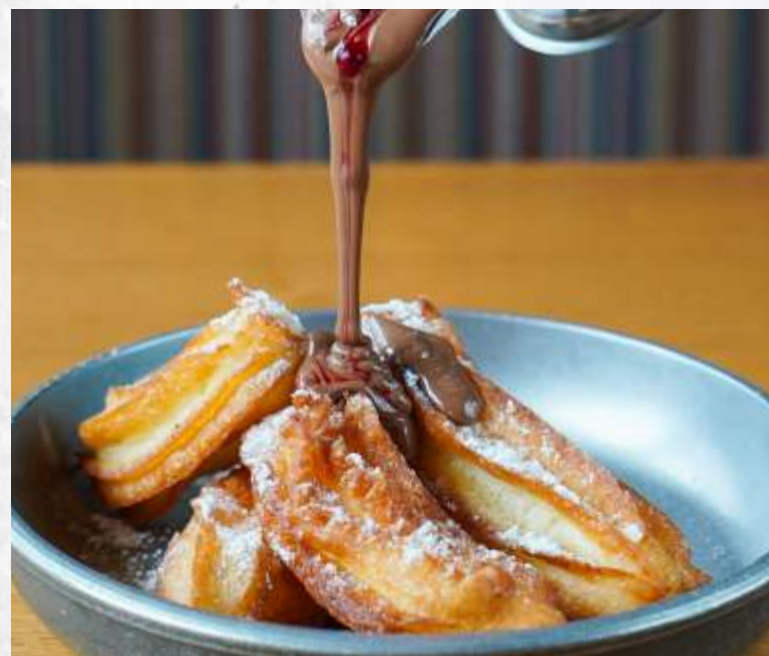
SPANISH CHURROS WITH CHOCOLATE AND LINGONBERRIES