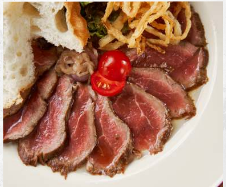
CARVED ROAST BEEF SERVED WITH CIABATTA