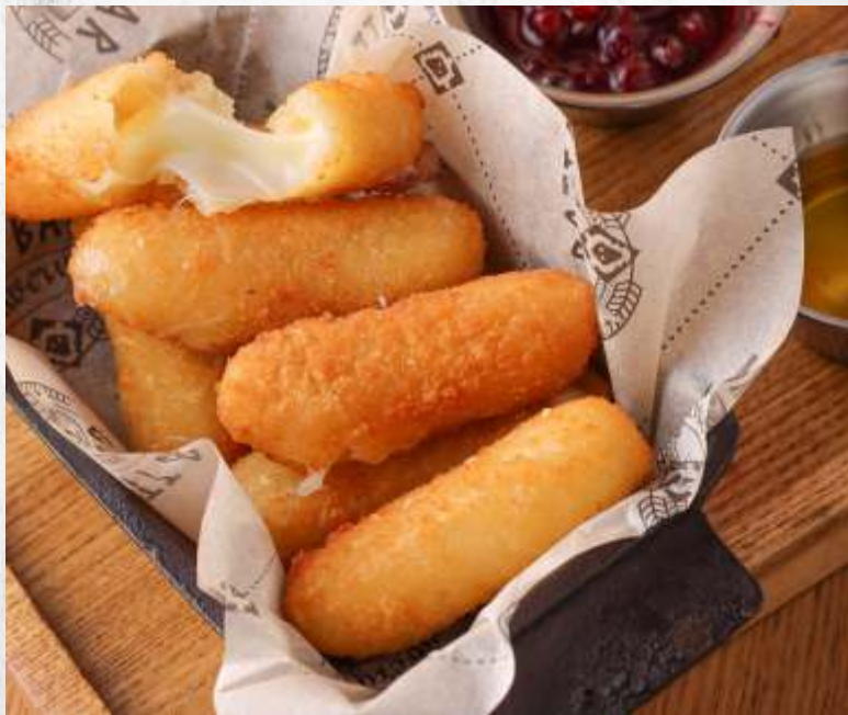
SULUGUNI CHEESE STICKS SERVED WITH RED BILBERRY JELLY AND HONEY