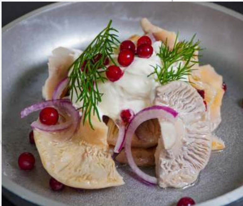
RUSSULA MUSHROOMS SERVED WITH SOUR-CREAM, ONIONS AND CRANBERRIES