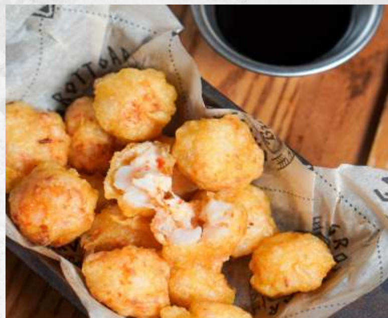
SNOW CRAB SHRIMP DONUT SERVED WITH EEL SAUCE