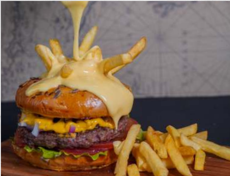
HOT CHEDDAR CHEESE BAGEL BURGERSERVED WITH FRIES