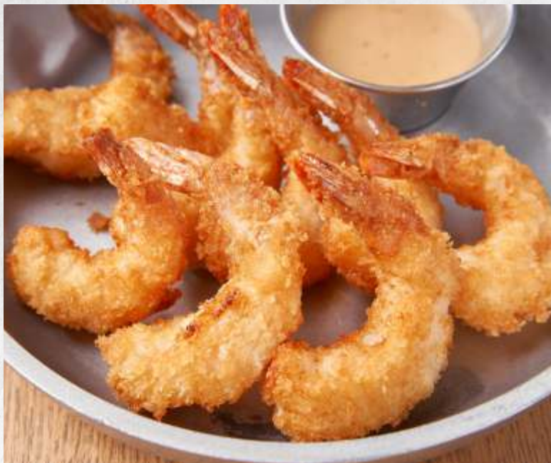
PANKO-CRUSTED TIGER SHRIMPS SERVED WITH ROUILLE SAUCE