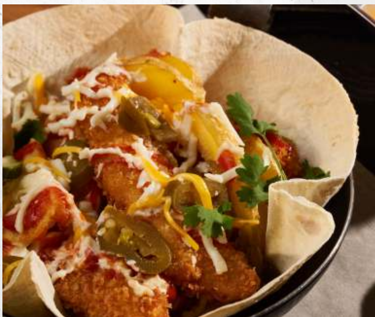
CHICKEN AND CHIPS WITH MOLTEN CHEDDAR CHEESE