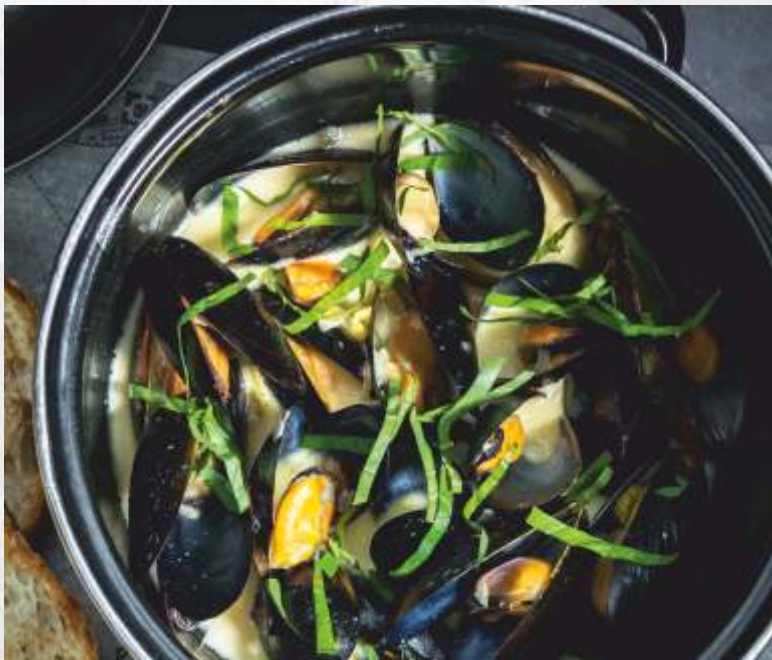
MUSSELS SERVED WITH CREAMY SAUCE