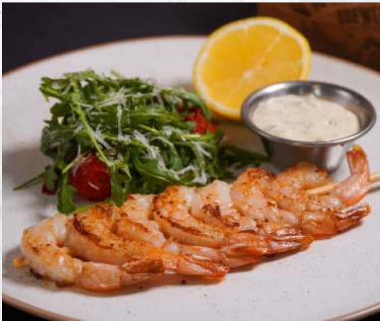
GRILLED SHRIMP SERVED WITH TARTAR SAUCE