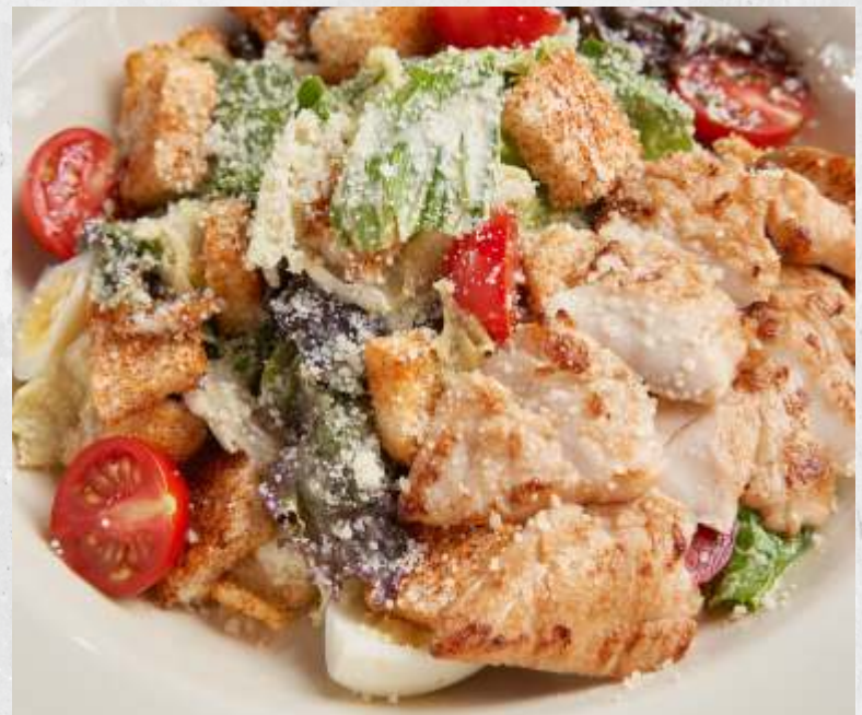
CHICKEN CAESAR SALAD SERVED WITH WHEAT CROUTONS