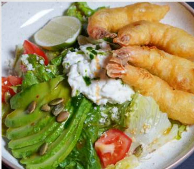
CRISPY TIGER PRAWNS WITH AVOCADO AND STRACCIATELLA