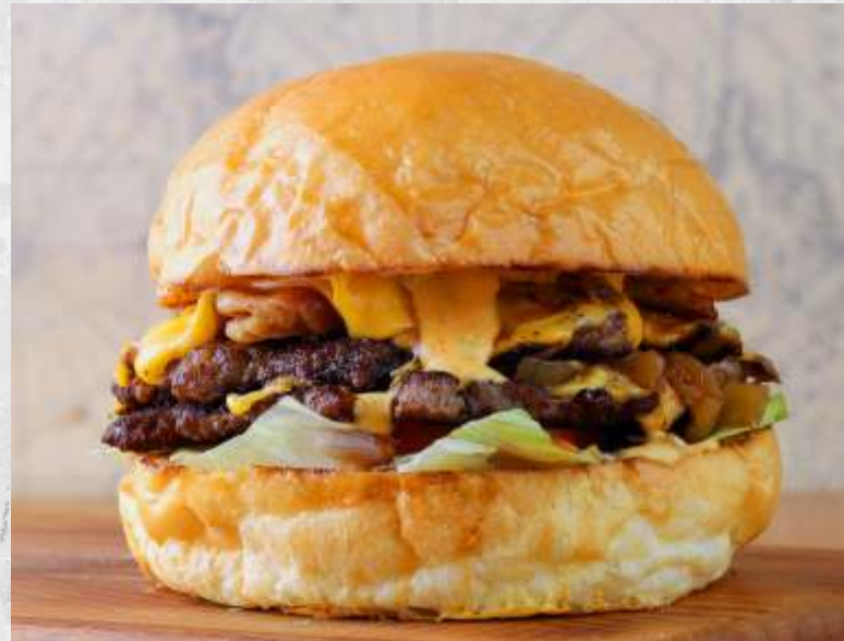
MARBLED BEEF BURGER WITH OYSTER MUSHROOMS 'AND COCONUT MILK SAUCE