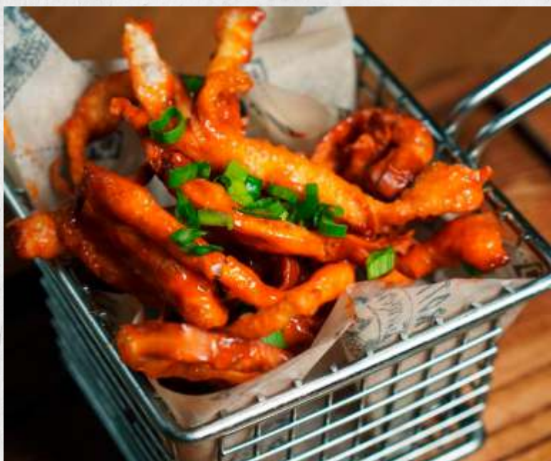
CHECHIL (SMOKED STRING CHEESE) IN KIMCHI SAUCE