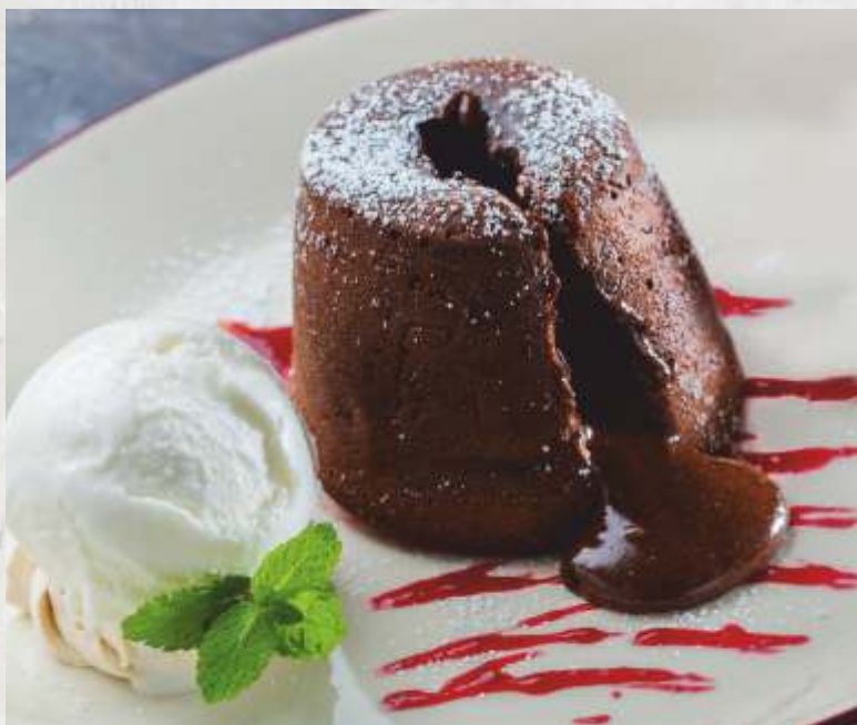
CHOCOLATE FONDUE SERVED WITH A SCOOP OF VANILLA ICE-CREAM