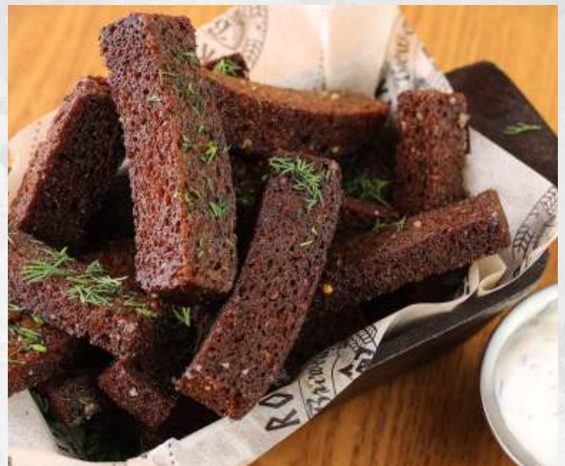
GARLIC CROUTONS SERVED WITH CREAMY SAUCE