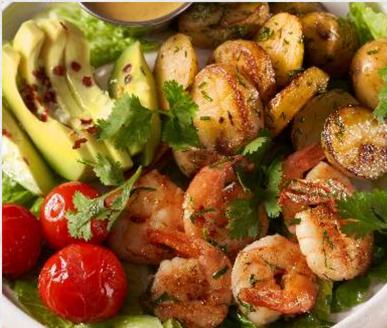
TIGER SHRIMPS WITH BABY POTATOES AND AVOCADO