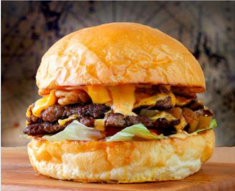
SMASH CRISPY MARBLED BEEF BURGER WITH MEAT SAUCE