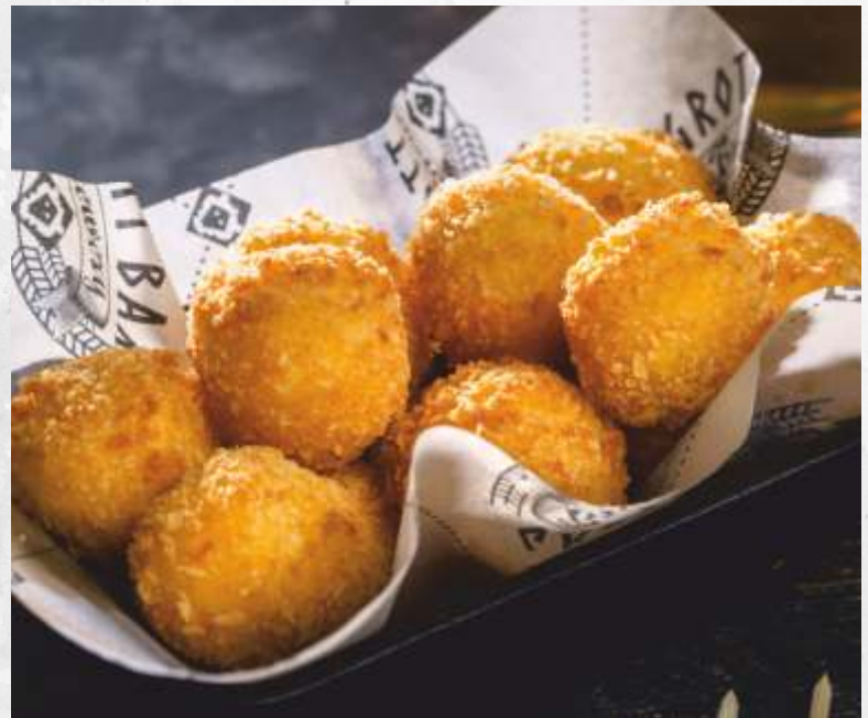
FRIED MOZZARELLA BALLS SERVED WITH CREAMY SAUCE AND HONEY