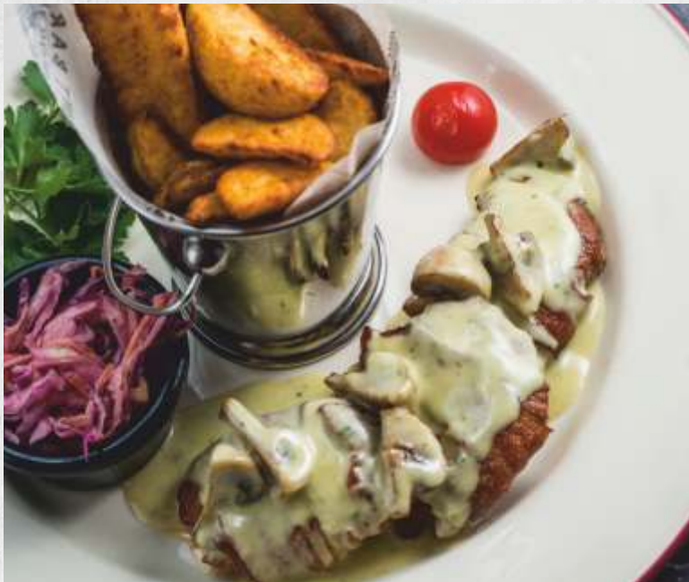
PORK MEDALLIONS IN CREAMY MUSHROOM SAUCE SERVED WITH HOUSE POTATOES, COLESLAW AND A CHERRY TOMATO