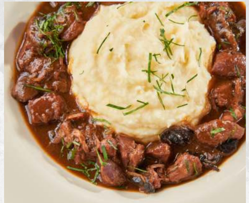
TRADITIONAL BROWN ALE IRISH STEW SERVED WITH MASHED POTATOES