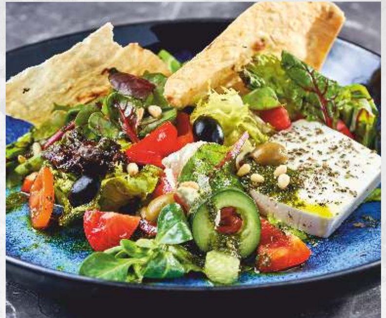
FRESH VEGETABLES (MIXED GREENS, SWEET PEPPER, TOMATOES, CUCUMBERS, BLACK OLIVES, CHERRY TOMATOES, PINE NUTS) AND FETA CHEESE. SERVED WITH PESTO SAUCE